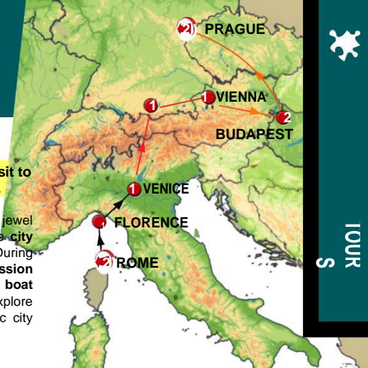
FAMOUS CARNIVAL IN VENICE, ITALY